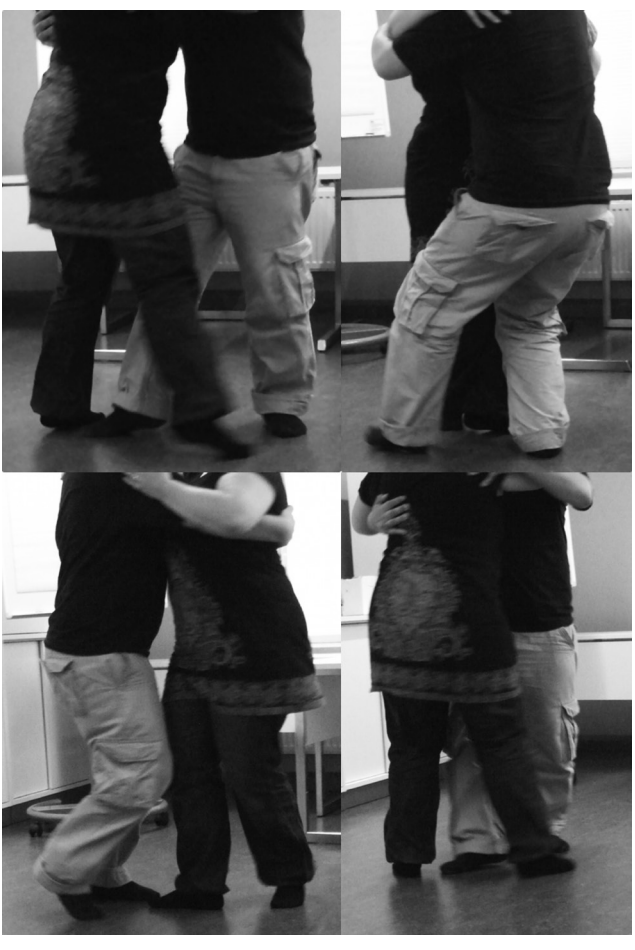
Figure 2. Hambo rotation.

interfere with each other so that the dancers can achieve a smooth, continuous rotation, which, in its turn, strengthens the horizontal movement. According to Asta, it is important that the asymmetrical movement has a clear and regular pulse both horizontally and vertically, and she stated that this is achieved only when the upper torso is actively taken into the dance from the first step. Jussi also emphasized the relevance of upper torso in making the rotation smooth and floating: the torso as well as the hold between the partners